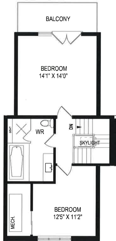
THIRD FLOOR 630 SQUARE FEET CEILING HEIGHT 8'0"